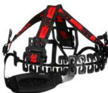
3M™ SecureFit™ H-Series Hard Hat Suspension Replacement