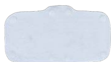
3M™ Hard Hat Terry Cloth Sweatband